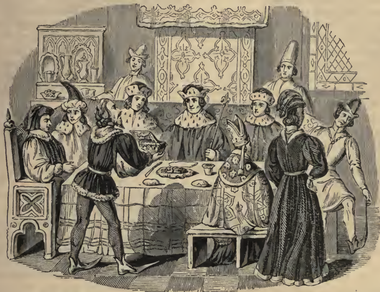
COUNT DE HARCOURT PRESENTING THE COMFIT-BOX TO THE KING. Designed from Royal MS. 14 E. 4

Bourbon, and sir Menaut de Noailles to the count de Foix*. When this was done, it was about four o'clock in the afternoon: the count de Foix took leave of the king, the duke of Bourbon, and the other lords, and, leaving the hall, went into the court, where he found his horses and attendants waiting for him. The count and his company having mounted, returned to his lodgings, much pleased with the reception and entertainment the king of France had given him, and praised him exceedingly when conversing with his knights. During the time the king of France and count Gaston de Foix were at Toulouse, many tokens of affection passed between them, which was encouraged to the utmost of their power by the marshal de Sancerre and the lord de la Riviere, because they saw the king, as well as the duke of Bourbon, had conceived a friendship for the count de Foix.